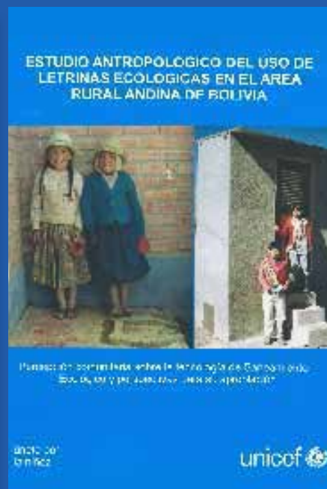
An anthropological study about ecological latrines in the Andean rural area" completed by LWB, Bolivia (publication cover page)