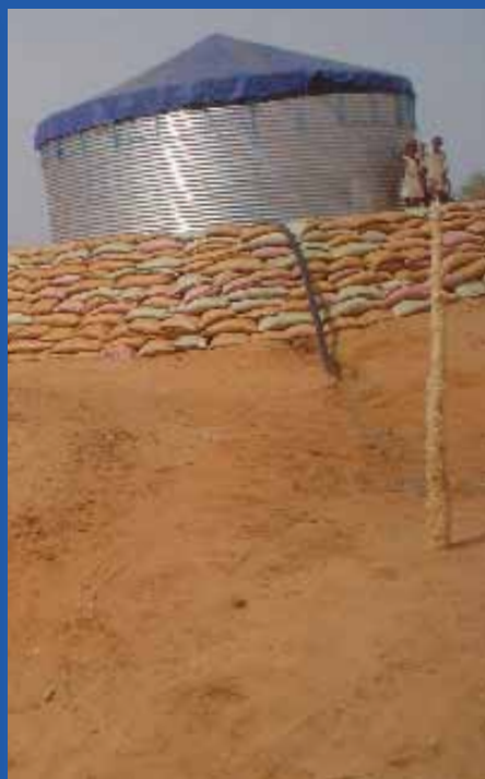
"An evaluation of emergency interventions in Somalia"