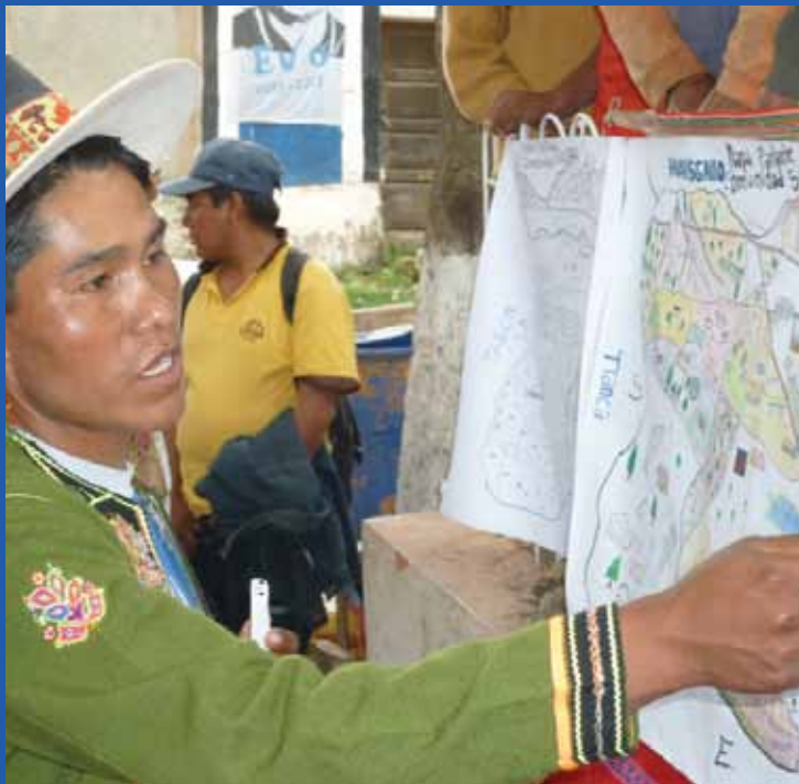
River Basin community Management in Potosi, Bolivia