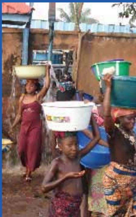
"Improvements in the access to Potable Water in Jigawa, Nigeria"

Country: Bolivia Client: Ministry of Environment and Water (MMAyA), La Paz Inter-American Development Bank