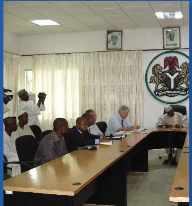
A WSSSRP coordination meeting in Kano, Nigeria